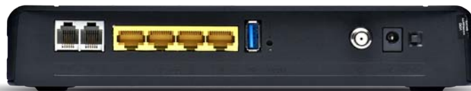
Technicolor TC7200 back panel

TECHNICOLOR WORLDWIDE HEADQUARTERS 1, rue Jeanne d'Arc 92443 Issy-les-Moulineaux France Tel: +33 (0)1 41 86 50 00 - Fax: +33 (0)1 41 86 58 59